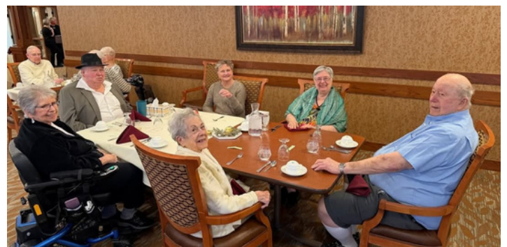
Silver and Gold Gala

If you need a current resident directory, stop by the Concierge desk