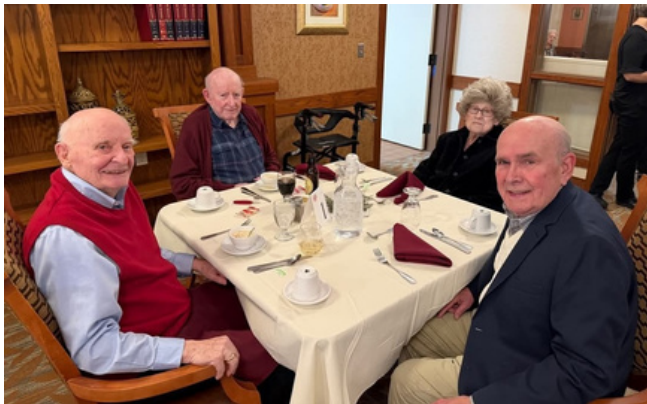
Silver and Gold Gala