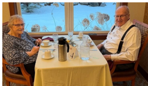
Silver and Gold Gala